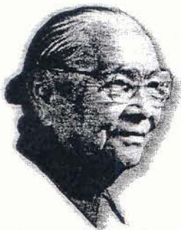
Dr. Annie Wauneka