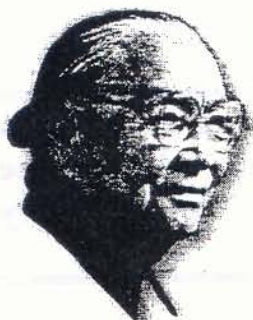
Dr. Annie Wauneka